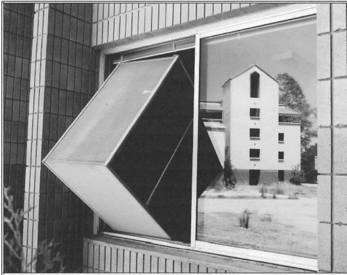
A PIECE OF FURNITURE leans out the window of a soon to be demolished barracks building. Reflected in the window is building 852, one of the few to be saved with it's 400 dorm-style rooms.